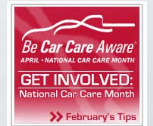
Monthly tips for getting involved are on the new Web site.