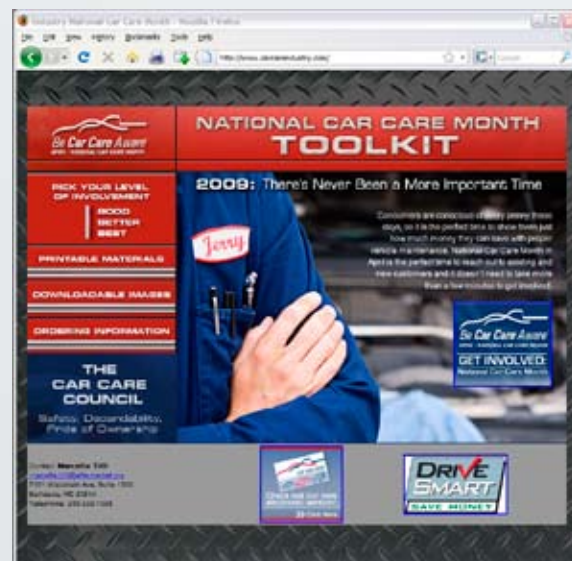
The 2009 National Car Care Month Toolkit is available at www.carcareindustry.com

In 2009, the council has made it a priority to aggressively engage repair shops and parts stores in the "Be Car Care Aware" campaign as better communicators to their customers with specific emphasis on involvement in Car Care Events. While National Car Care Month in April is a nationwide celebration, the events are all local. A new "community car care" focus will be developed.