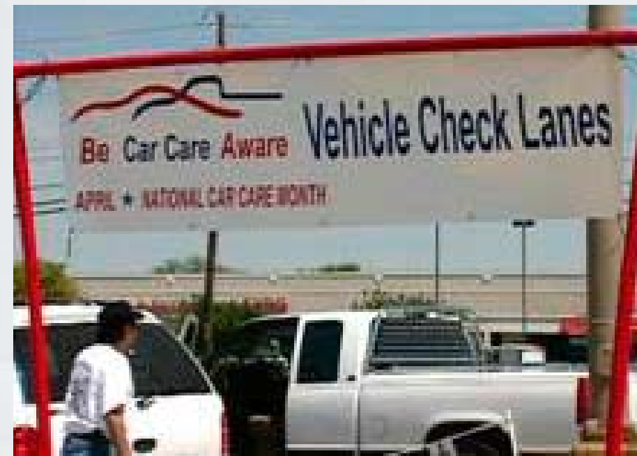
More than 700 events, in 12 states nationwide, were held in 2008.

In addition to expanding on-going public relations and media outreach reported in the 2008 report, the Car Care Council has created and will implement a number of new and exciting initiatives in 2009. Here's a sampling of what's planned: